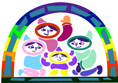
ᐃᓄᓄᓄ ᐃᓄᓄᓄ ᐃᓄᓄᓄ ᐃᓄᓄᓄ Not Deciding Alone

knowledge shared goals purpose expertise food trust collaborative making space communication kindness collaboration shared priorities respect respectful perspectives drink water